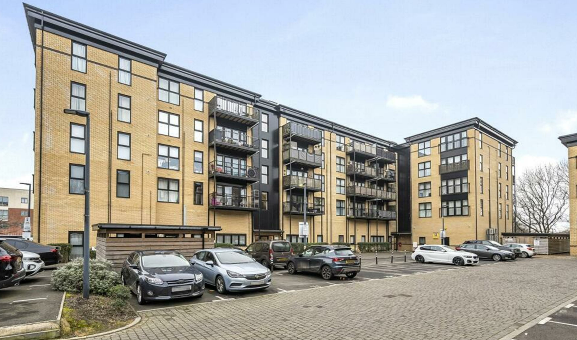
Giles Crescent, Stevenage